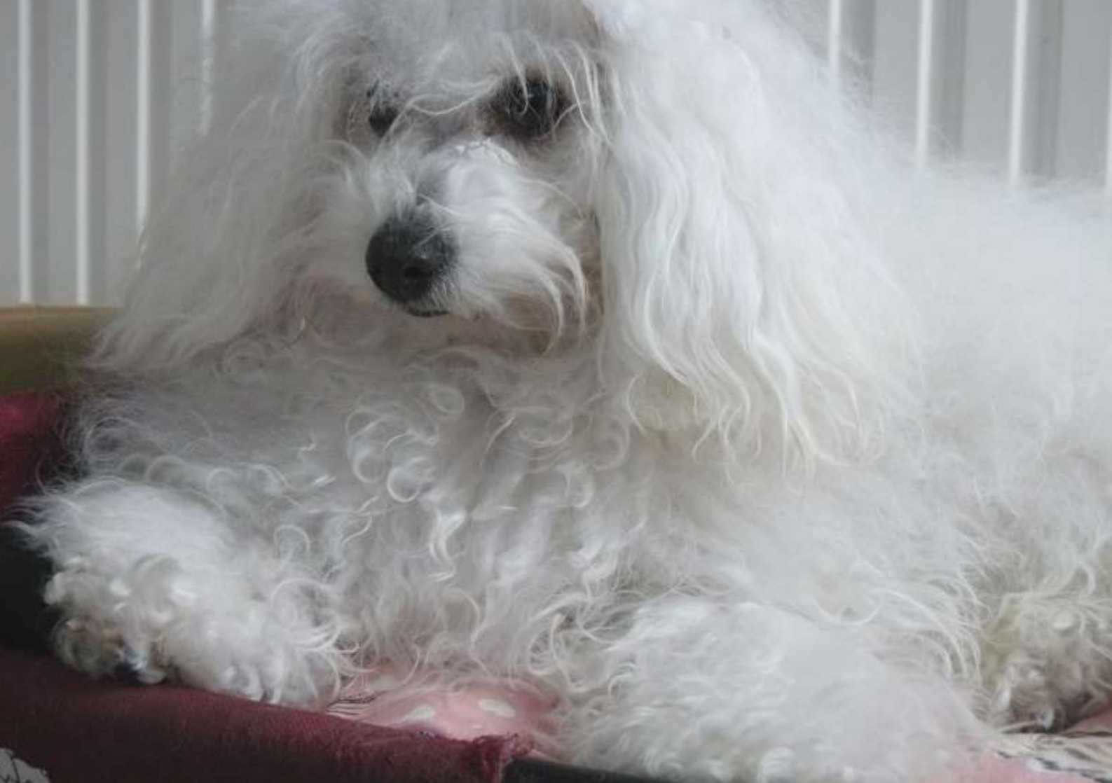
Bolognese (Dolly) Waiting For Her Bath